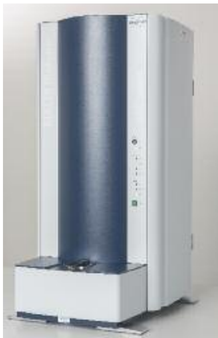
Bruker is continually adding workflows based on the MALDI Biotyper.

solution for routine usage in the microbiology laboratory. The company is continually adding workflows based on the MBT, including MBT Sepsityper for direct identification from positive blood cultures and subsequent resistance testing. Bruker also markets molecular tests for yeasts and carbapenemase-producing Enterobacteriaceae (CPE), along with the IR Biotyper, for strain typing to target hygiene management. Bruker additionally offers Micronaut for antimicrobial susceptibility testing of bacteria and yeasts. These in vitro diagnostics are used in routine laboratories in the fields of human medicine and other microbiology markets. Visitors to the company's stand at BSMT were able to talk to representatives about all of these exciting products.