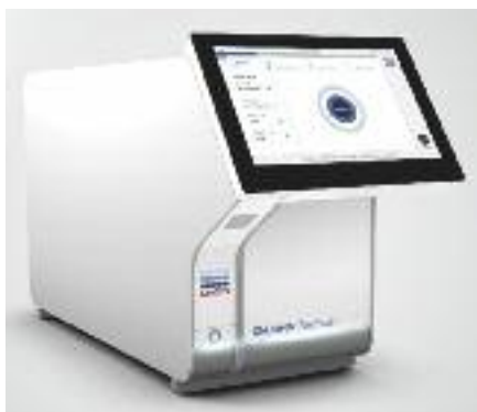
The QIAstatDx instrument was Qiagen's feature product at the BSMT symposium.

Qiagen is the leading global provider of Sample to Insight solutions to transform biological materials into valuable molecular insights. Qiagen sample technologies isolate and process DNA, RNA and proteins from blood, tissue and other materials. Assay technologies make these biomolecules visible and ready for analysis. Bioinformatics software and knowledge bases interpret data to report relevant, actionable insights. Automation solutions tie these together in seamless and cost-effective molecular testing workflows. Qiagen provides these workflows to more than 500,000 customers around the world in molecular diagnostics (human healthcare), applied testing (forensics, veterinary testing and food safety), pharma (pharmaceutical and biotechnology companies) and academia (life sciences research).