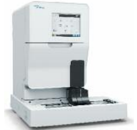
The UF-5000 from Sysmex represents the latest in urinalysis technology.

choice with a broad IVD menu. Elsewhere, do less and see more with a truly digital automated urinalysis system that sets the new standard for accuracy and efficiency. The new Atellica UAS 800 analyser is a truly digital automated urinalysis system, and lets you manage more samples with less staff in shorter time, while never compromising on high-quality results. The system is a completely automated urine sediment analyser designed to minimise the need for manual microscopy.