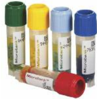
The 2D Datamatrix on show from Pro-Lab Diagnostics .