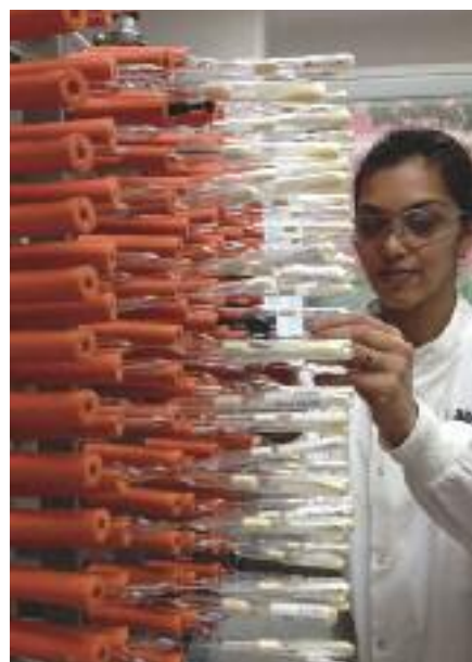
All NCTC strains are available in a freeze-dried format

The National Collection of Type Cultures (NCTC) is one of four Culture Collections operated by Public Health England. Founded in 1920, it is the longest-established collection of its type, and serves as a United Nations Educational, Scientific and Cultural Organization (UNESCO) Microbial Resource Centre (MIRCEN). NCTC holds almost 6000 type and reference bacterial strains, many of medical, scientific and veterinary importance. The strains support academic, health, food and veterinary institutions and are used in microbiology laboratories and research institutes worldwide. All strains are available in a freeze-dried format, and DNA from over 150 strains is available via the online catalogue.