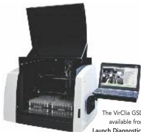
The VirClia GSD, available from Launch Diagnostics .

Launch Diagnostics has a large range of products and instrumentation for the