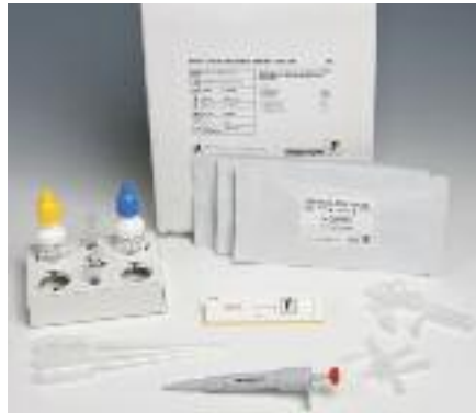
One of the RIDA QUICK range of rapid diagnostic tests for the detection of various pathogens from R-Biopharm Rhone .