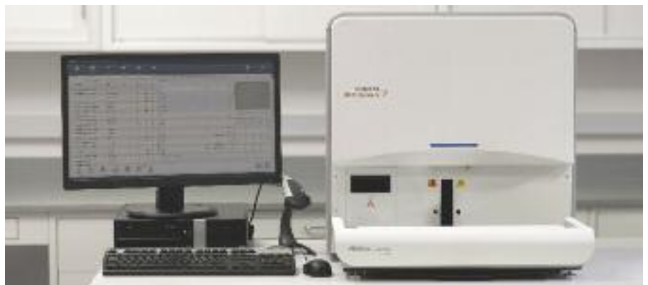
Siemens Healthineers offers user-friendly systems that reduce the need for manual input.

The VERSANT kPCR Molecular System is a flexible molecular diagnostics platform that enables the laboratory to process multiple sample types, run up to six assays per sample, and consolidate Siemens Healthineers' molecular tests, IVD assays from other manufacturers, and laboratory developed tests (LDTs) on one platform. This user-friendly system reduces manual labour, allowing personnel to spend time on other value-added activities, while providing outstanding assay performance and