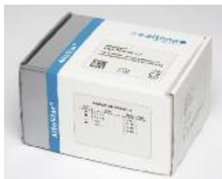
The AltoStar series of reagents, platforms and bespoke software from altona Diagnostics offers automated workflow for RT-PCR testing.

BioConnections focused on two key areas at the recent BSMT meeting. The Resist product range including Resist 4 OKNV is a 15-minute lateral flow test that confirms the Big Four carbapenemases (KPC, NDM, OXA & VIM) as accurately as the top molecular assays, without the need for instrumentation so at a fraction of the cost. Broth Micro Dilution (BMD) is the international gold standard for antimicrobial sensitivity testing (AST). This is the product that the company has introduced to the UK over the past few years. Manufactured in Germany by Merlin Diagnostika, Micronaut BMD products can be used without equipment or automated, or even linked to MALDI-TOF MS. BMD is the only acceptable