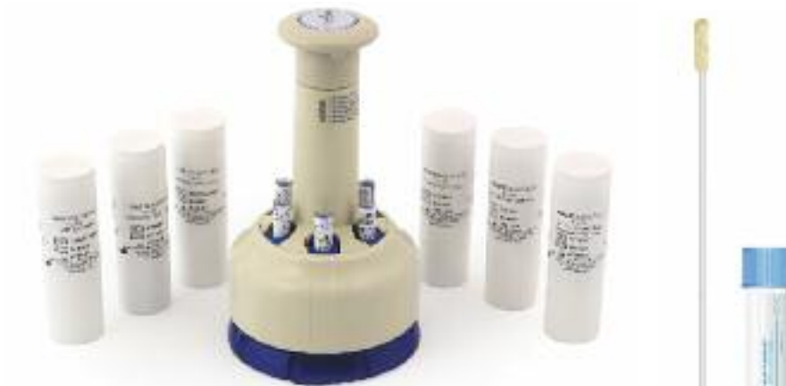
Mast has produced AST products since 1957.

microbiology and infectious disease laboratory, from rapid tests to multiplex molecular biology assays, with various instruments to complement the assays. The company recently introduced a number of new, advanced instruments and assays to its portfolio. The VirClia chemiluminescence monotest from Vircell includes an extensive range of infectious disease serology tests in a simple-to-use monotest format; and from Abacus Diagnostica, a rapid molecular assay with an innovative instrument employing a simple-to-use reagent concept from sample to result on a plastic test chip.