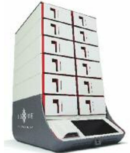
The BIOFIRE from bioMérieux , a rapid syndromic multiplex PCR system.

method for AST of colistin. The Merlin BMD Colistin strip is already in use in many UK laboratories.