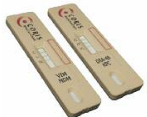
Resist 4 OKNV, a 15-minute lateral flow test from BioConnections .

Bruker is the leader in matrix-assisted laser desorption/ionisation (MALDI)-based microbial identification, and the MALDI Biotyper (MBT) is the globally recognised