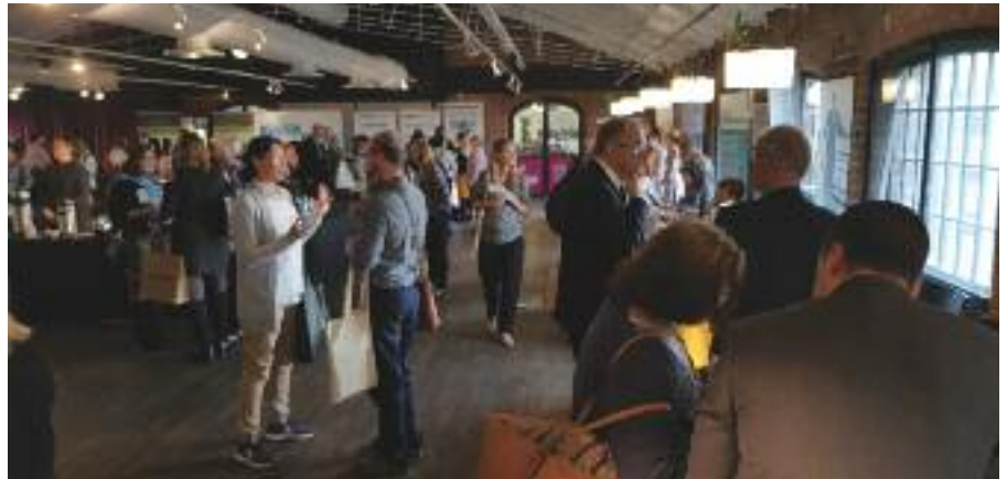
Commercial support proves crucial in the continued success of BSMT conferences and symposia.

For the past 40 years the approach to studying infections in the airways of patients with cystic fibrosis (CF) has largely paralleled that taken in the study of other human infectious diseases. Typically, a microorganism recovered in culture from an infected site is studied in isolation using various in vitro and in vivo models intended to approximate some