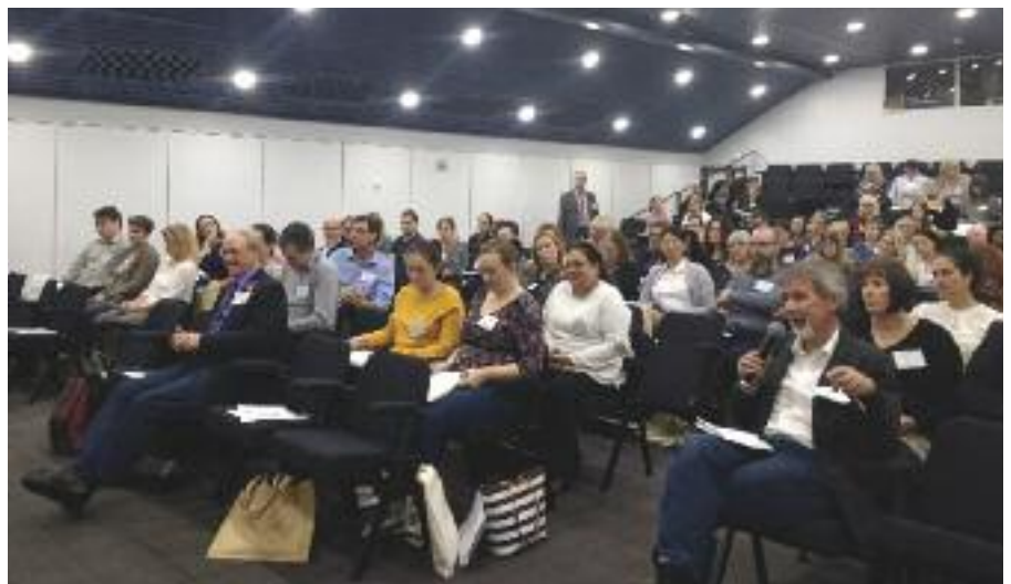
The Merseyside Maritime Museum played host to the symposium delegates, speakers and sponsors, many of whom had travelled significant distances.

Infections affecting a child almost always affect the family who care for that child, particularly in the case of the common cold. Children may also be infected by a family member with infections such as tuberculosis (TB) and